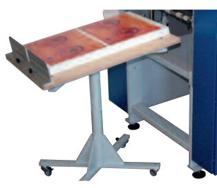
The standard Jogger may be sizes.